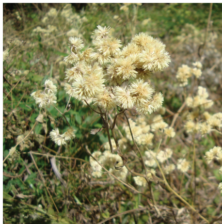
FIGURE 1: Inflorescences of Achyrocline satureioides (Lam.) DC., Asteraceae.

We also have recently described the simultaneous incorporation of these poorly soluble flavonoids of Achyrocline satureioides extract into nanoemulsions by means of spontaneous emulsification intended for topical use [6]. Such a procedure proved to be able to efficiently incorporate the main flavonoids from the hydroethanolic extract in monodisperse nanoemulsions (200 nm range) consisting of a medium chain triglycerides oil core stabilized by a binary mixture of surfactants (egg lecithin and polysorbate 80). Flavonoids seem to be located in the oil phase of nanoemulsions since they were not detected in the aqueous phase after separation on ultrafiltration membranes. The 3- O -MQ release rate was influenced by the extract content in the nanoemulsion with approximately 90% released after 8 h of kinetics. The first-order model provided the most satisfactory fitting of the release data from extract-nanoemulsions [6].