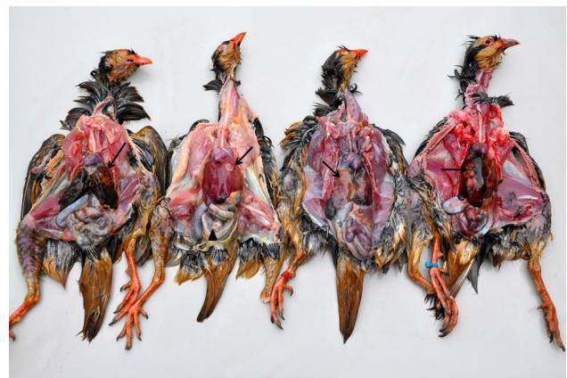
Figure 2. Chukar partridges ( Alectoris chukar ) affected with well-delimited, circular to multifocal or coalescing areas of necrosis on the hepatic surface (arrows). There is also large area of cecal necrosis (arrowhead). Both lesions are associated with Histomonas meleagridis infection.

Definitive diagnosis of the two conditions was based on typical signs and lesions [2-8], in addition to complementary IHC [3] and PCR results for confirming mycoplasmosis. High rates of purchase and resale of birds in the absence of appropriate sanitary management (quarantine, routine anthelmintic administration and vaccination), overcrowding, and poor enclosure hygiene were identified as the main predisposing factors in these outbreaks. The difficulties and losses observed in mycoplasmosis cases, despite attempts of different treatment protocols, contrasted with the adequate results observed after disease vaccination.