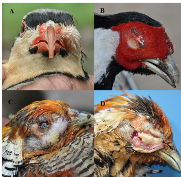
Figure 1. A – Chukar partridge ( Alectoris chukar ) affected with pronounced infraorbital edema. B – Silver pheasant ( Lophura nycthemera ) with ocular and nasal discharges. C – Golden pheasant ( Chrysolophus pictus ) showing conjunctivitis, ocular discharge and increased infraorbital volume. D – Golden pheasant ( Chrysolophus pictus ; pictured in C); infraorbital area filled with caseous material. The three cases were confirmed to be infected with Mycoplasma gallisepticum .

The necropsies revealed that the increased infraorbital volume was filled with a translucent, mucous to caseous material (Figure 1D). An infiltrate of macrophages and cellular debris occupied the paranasal sinuses. The PCR confirmed the presence of Mycoplasma gallisepticum in 4 of the 7 samples tested. The IHC staining showed positive staining in the air sacs in 4 cases. During the outbreak period, the farmer implemented some treatment protocols (for example, tylosin, gentamicin and tetracycline administered by oral and/or intramuscular routes, or surgical removal of the infraorbital caseous material), all of which produced low recovery rates. The condition produced a mortality