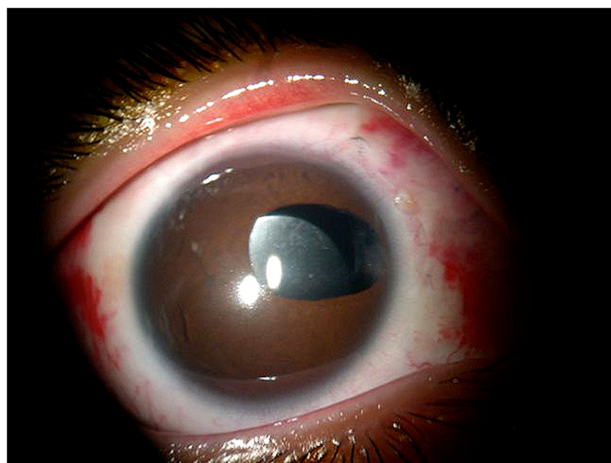
Figure 2 Dislocation of intraocular lens.

On the first day of follow-up, findings were unremarkable. At one-week follow-up, slit-lamp examination showed an inflammatory reaction in the anterior vitreous and anterior chamber, despite use of topical and systemic steroids. Two months after surgery, visual acuity had improved to 20/200 in the right eye, and the patient switched to a left exotropia. A progressive posterior capsular opacity was detected in the visual axis, and a neodymium YAG laser capsulotomy was performed in the right eye. One year after surgery, dislocation of the intraocular lens was observed by slit-lamp examination. Ultrasound biomicroscopy showed a displaced intraocular lens behind the ciliary body at 7–8 clock hours. The intraocular lens haptic was dislocated to the inferior temporal quadrant (Figure 2). A scleral intraocular lens fixation and anterior vitrectomy were performed to reposition the intraocular lens.