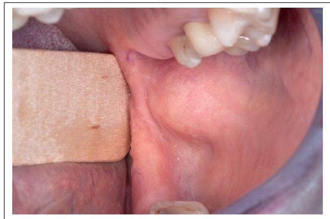
Figure 1. Case 2 – the swelling on the inside of the left cheek can be seen.

A 48-year-old female patient presented with a swelling on the inside of the left cheek. The medical history was