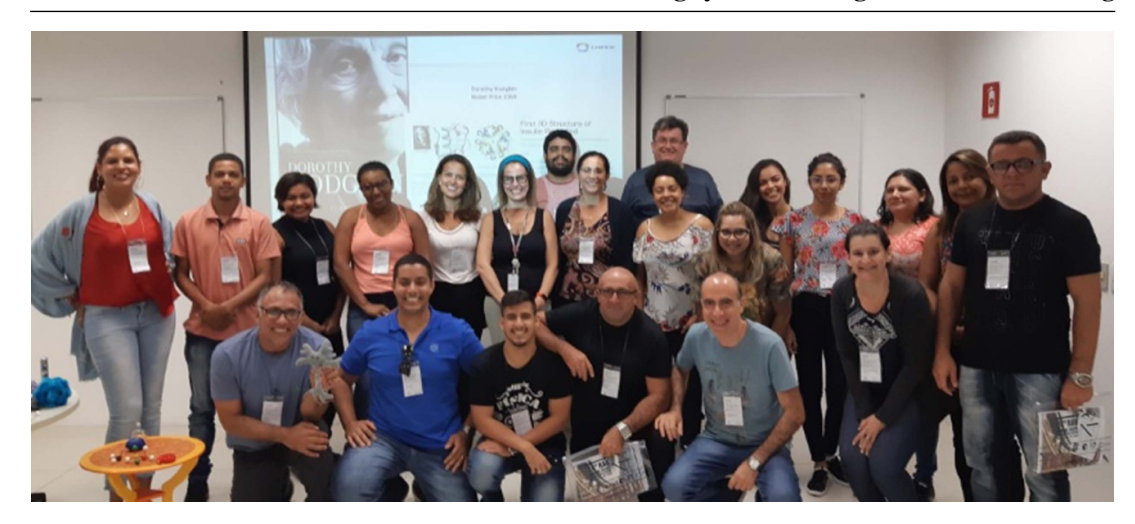
Figure 2. Twenty teachers participating in the 1st edition in 2019 with a speaker and one of the authors and members of the organizing committee.