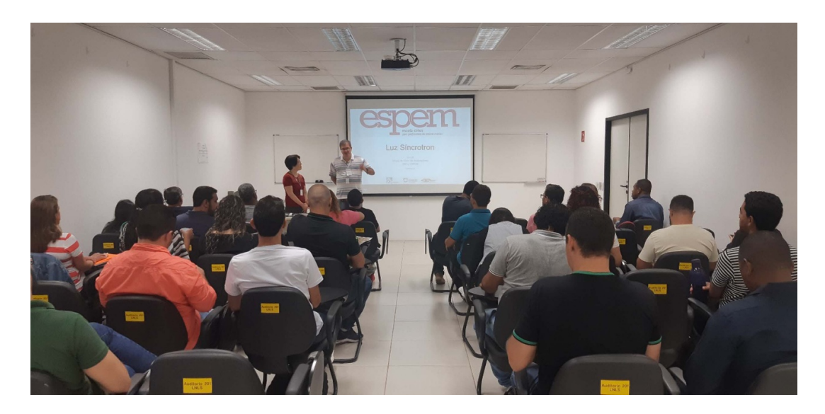
Figure 3. Thirty-five teachers participating in the 2nd edition in 2020 with one of the authors and a member of the organizing committee.

All 55 teachers were interviewed and commented on the stimulus in their teaching career promoted by ESPEM, as shown in table 2.