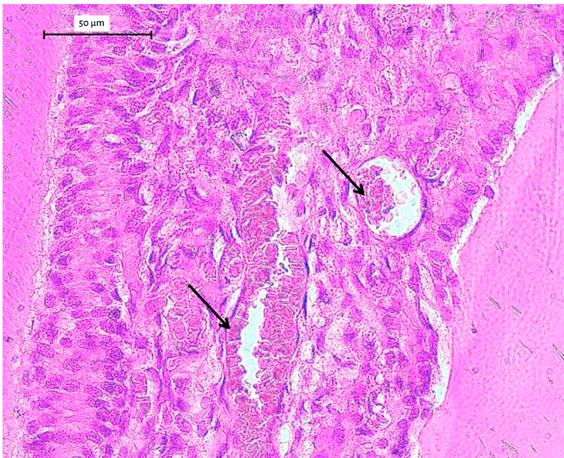
Figure 1: Control group. Normal tissue pulp with no degeneration and inflammatory signs. Note the hyperemic aspect in the coronal pulp of right inferior first molar of Albinus Wistar rat (black arrows). H&E, 40X magnification.

Both intra-observer and inter-observer reproducibility to repeated measures showed a perfect concordance of k = 1 . No degeneration was observed in pulp blood vessels of the control group (Figure 1).