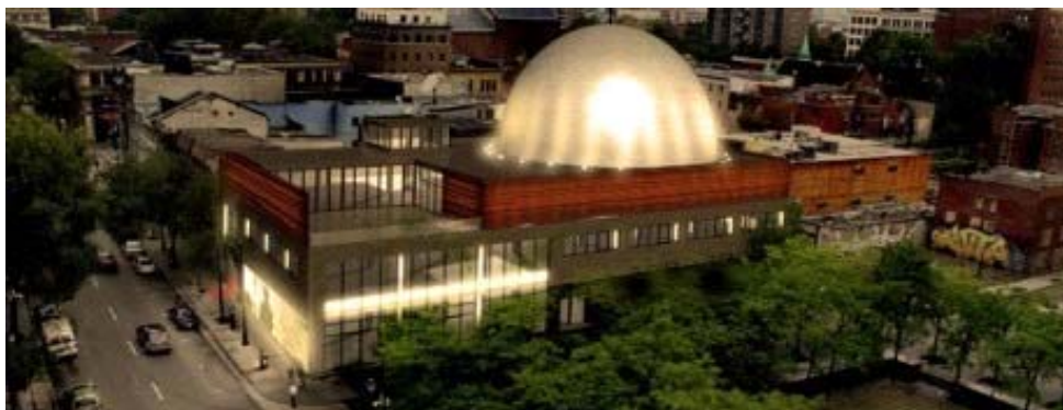
Figure 1 – External Image of the Société des Arts Technologiques (SAT).

presented in 2013 during the Festival du Nouveau Cinéma, and had all its technical structure adapted for presentation in the Dome of SAT.