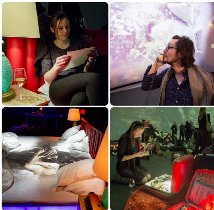
Figure 2 – Images sequence of Rouge Mékong performance.

A spectator reads the letter left by the character Sarah; an spectator receives a call from Sarah; projection in bed; memory of Sarah and her ex-boyfriend; a spectator looks at a suitcase with Sarah's personal belongings.