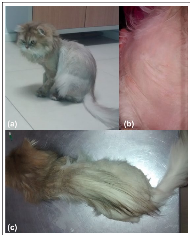
Figure 1 (a) Emaciation, muscle loss, unkempt haircoat and alopecia. (b) Fragile thin inelastic skin. (c) Bilateral symmetrical alopecia, unkempt haircoat, and potbellied abdomen

hyperadrenocorticism (HAC). Blood work and urine analysis results are shown in Table 1. A serum fructosamine concentration suggested good control ( 369 \mu\text{mol/l} ; reference interval [RI] for good diabetic control established by the employed laboratory 350\text{--}400 \mu\text{mol/l} ). However, given the persistence of clinical signs and the results of serial blood glucose evaluation (Table 1, Figure 2), the glargine dose was increased to 4 \text{ U q12h SC} . One week later, a low-dose dexamethasone suppression test (LDDST; using 0.1 \text{ mg/kg} dexamethasone IV) was conducted, the results of which proved compatible with pituitary-dependent HAC (PDH): basal cortisol 143.7 \text{ nmol/l} (RI 10\text{--}138 \text{ nmol/l} ), 4 \text{ h} post-dexamethasone 64.6 \text{ nmol/l} and 8 \text{ h} post-dexamethasone 49.4 \text{ nmol/l} (normal response <38 \text{ nmol/l} ). Additionally, bilateral adrenomegaly was present on abdominal ultrasonography (US), further supporting this diagnosis (Figure 3). The liver appeared a little heterogeneous on US, whereas the gall bladder showed thickened walls ( 0.25 \text{ cm} ), suggesting cholecystitis.