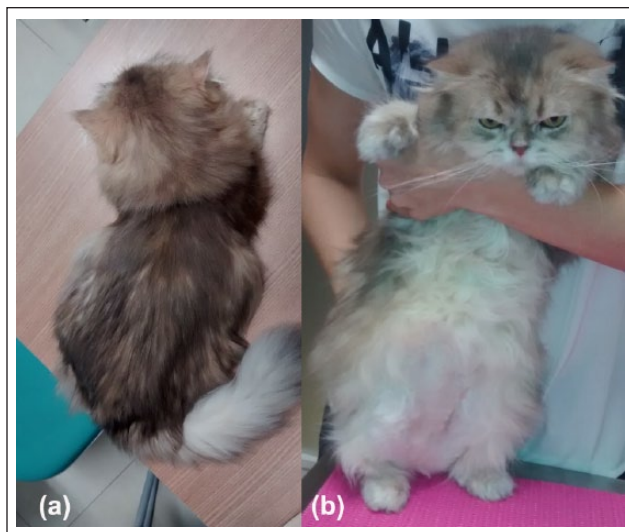
Figure 4 (a) Weight and muscle mass gain, complete haircoat re-growth and re-pigmentation. (b) Loss of potbellied appearance and ventral abdominal haircoat re-growth

months of trilostane treatment emphasizes the need for careful monitoring of insulin-treated diabetic cats with underlying HAC treated with trilostane, as iatrogenic hypoglycemia can pose a danger if the onset of remission is missed. 13 Indeed, in the current case, it would have been indicated to have checked the cat's glucose concentrations more frequently and/or for the owner to have conducted more intense monitoring at home (home blood glucose or urine glucose monitoring); unfortunately, this was not possible for the owner in question. Moreover, this cat might have been able to stop insulin even earlier, once normal fructosamine values and absence of glycosuria were detected at some time points before insulin withdrawal.