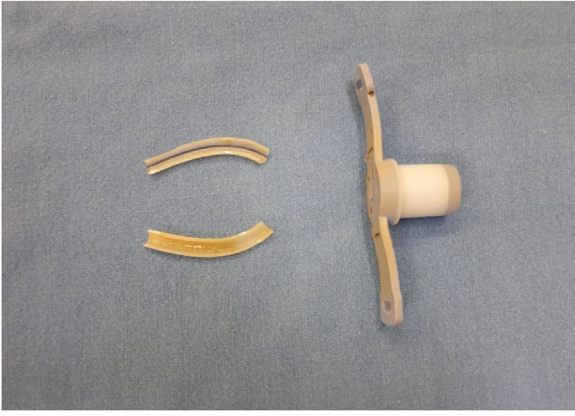
Figure 1 Incisions performed on tracheostomy cannula.

PowerBiofilm Kit (QIAGEN® – Cat n° 24000-50). For every patient the content of one 15 mL conical tube was used (half of tracheostomy tube) (Fig. 1). Once removed of the -80^{\circ}\text{C} freezer, samples were kept at room temperature for 10 min to facilitate handling. Using sterile material, tracheostomy tube was sectioned into small fragments on a Petri dish and DNA extraction was performed following DNeasy PowerBiofilm Kit protocol.