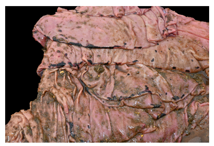
Fig.1. Wischnewsky spots in hypothermia in cattle. Multiple black dots and spots, sometimes random red ones, on the mucosal surface of the abomasum.