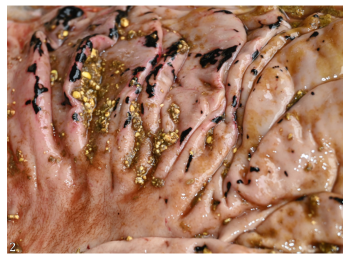
Fig.2. Wischnewsky spots in hypothermia in cattle. Black, flat, coalescing foci on the mucosal surface of the abomasum, mainly at the apex of the folds.