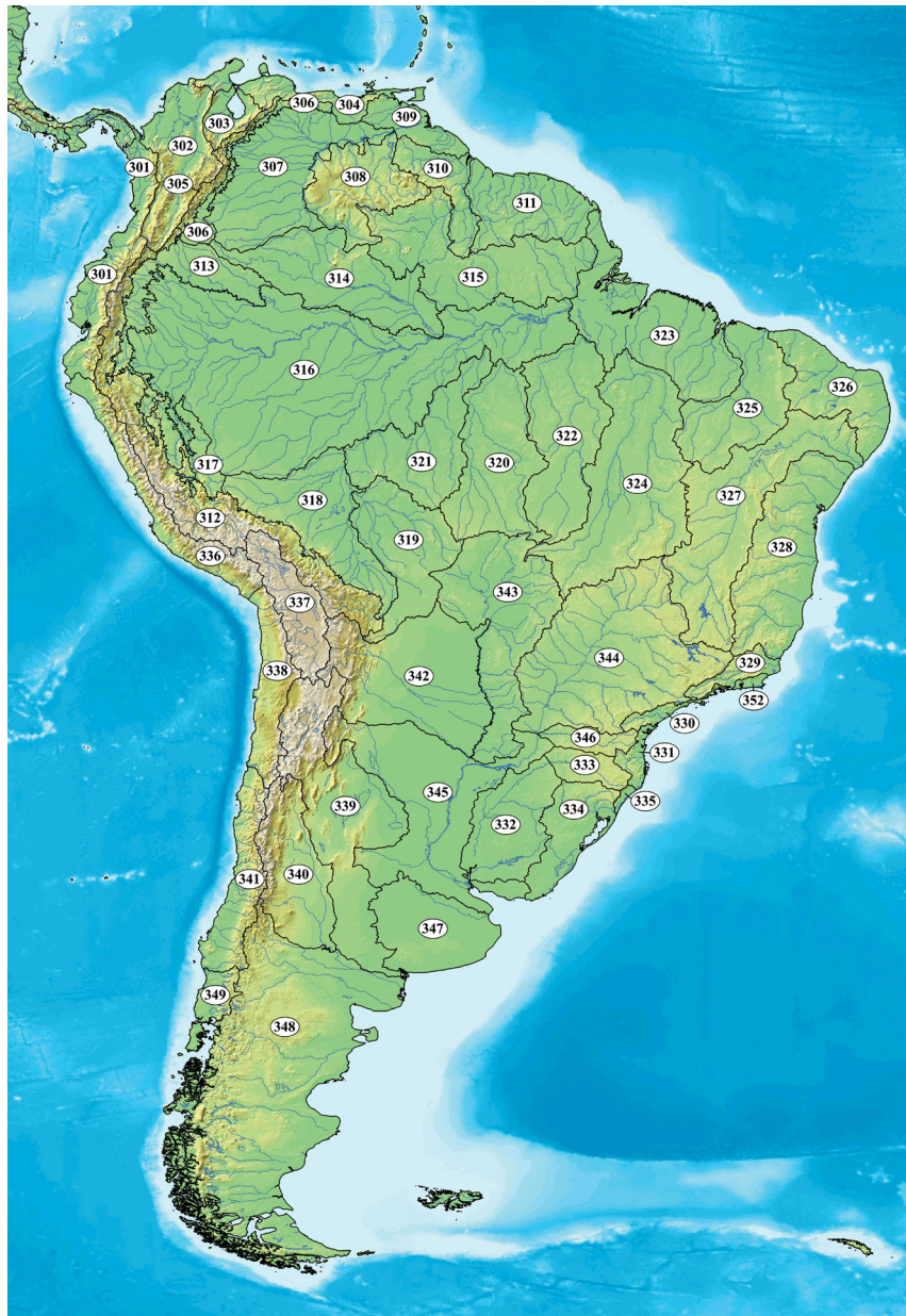
FIGURE 1 | Map of South America with area delimitation based on Abell et al. 's 2008 (Freshwater ecoregions of the world): 301 North Andean Pacific Slopes–Río Atrato; 302 Magdalena–Sinu; 303 Maracaibo; 304 South America Caribbean Drainages–Trinidad; 305 Orinoco High Andes; 306 Orinoco Piedmont; 307 Orinoco Llanos; 308 Orinoco Guiana Shield; 309 Orinoco Delta and Coastal Drainages; 310 Essequibo; 311 Guianas; 312 Amazonas High Andes; 313 Western Amazon Piedmont; 314 Rio Negro; 315 Amazonas Guiana Shield; 316 Amazonas Lowlands; 317 Ucayali–Urubamba Piedmont; 318 Mamoré–Madre de Dios Piedmont; 319 Guaporé–Itenez; 320 Tapajós–Juruena; 321 Madeira Brazilian Shield; 322 Xingu; 323 Amazonas Estuary and Coastal Drainages; 324 Tocantins–Araguaia; 325 Parnaíba; 326 Northeastern Caatinga and Coastal Drainages; 327 São Francisco; 328 Northeastern Mata Atlântica; 329 Paraíba do Sul; 330 Ribeira de Iguape 331 Southeastern Mata Atlântica; 332 Lower Uruguay; 333 Upper Uruguay; 334 Laguna dos Patos; 335 Tramandaí–Mampituba; 336 Central Andean Pacific Slopes; 337 Titicaca; 338 Atacama; 339 Mar Chiquita–Salinas Grandes; 340 Cuyan–Desaguadero; 341 South Andean Pacific Slopes; 342 Chaco; 343 Paraguay; 344 Upper Paraná; 345 Lower Paraná; 346 Iguassu; 347 Bonaerensean Drainages; 348 Patagonia; 349 Valdivian Lakes; 350 Galápagos Islands; 351 Juan Fernandez Island; 352 Fluminense. Not all the regions indicated on the map have records of characiformes.