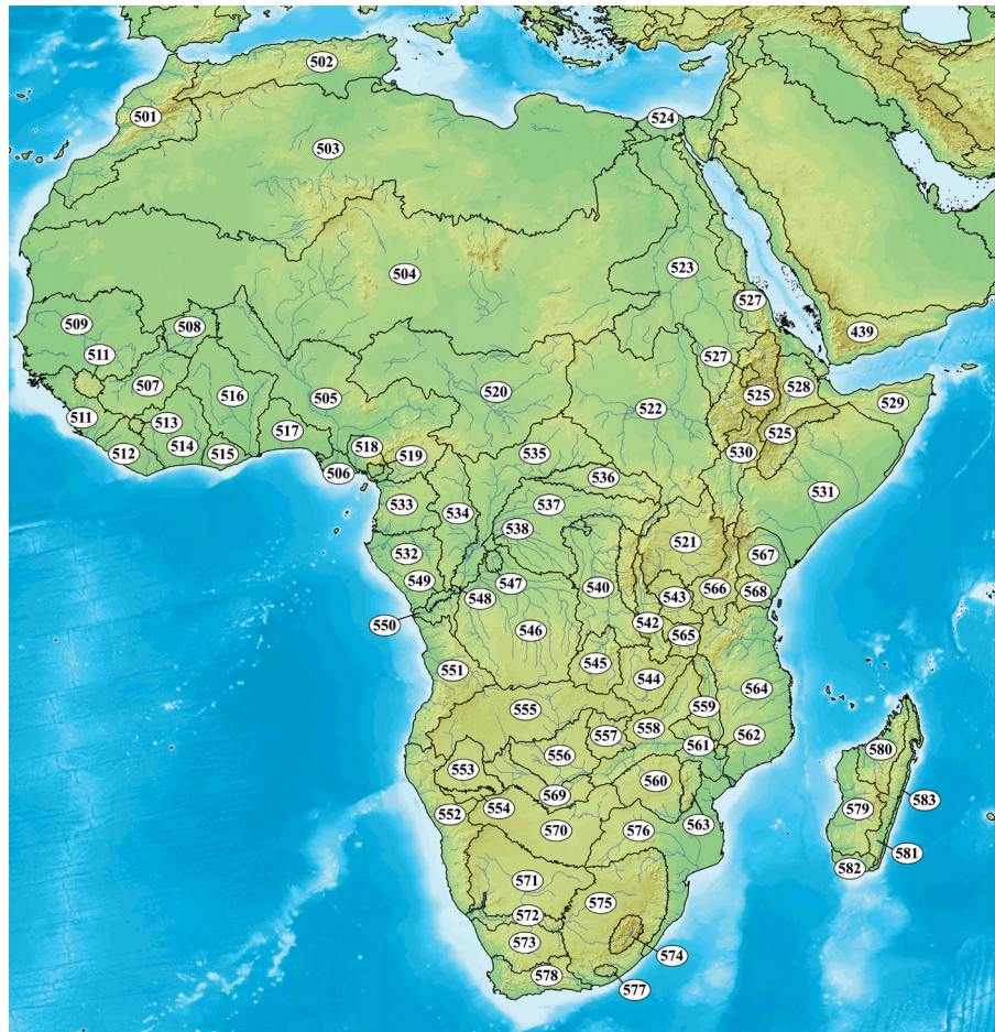
FIGURE 2 | Map of Africa and part of the Middle East with area delimitation based on Abell et al. 's 2008 (Freshwater ecoregions of the world): 439 Southwestern Arabian Coast; 501 Atlantic Northwest Africa; 502 Mediterranean Northwest Africa; 503 Sahara; 504 Dry Sahel; 505 Lower Niger–Benue; 506 Niger Delta; 507 Upper Niger; 508 Inner Niger Delta; 509 Senegal–Gambia; 510 Fouta–Djalou; 511 Northern Upper Guinea; 512 Southern Upper Guinea; 513 Mount Nimba; 514 Eburneo; 515 Ashanti; 516 Volta; 517 Bight Drainages; 518 Northern Gulf of Guinea Drainages–Bioko; 519 Western Equatorial Crater Lakes; 520 Lake Chad; 521 Lake Victoria Basin; 522 Upper Nile; 523 Lower Nile; 524 Nile Delta; 525 Ethiopian Highlands; 526 Lake Tana; 527 Western Red Sea Drainages; 528 Northern Eastern Rift; 529 Horn of Africa; 530 Lake Turkana; 531 Shebelle–Juba; 532 Ogooué–Nyanga–Kouilou–Niari; 533 Southern Gulf of Guinea Drainages; 534 Sangha; 535 Sudanic Congo–Oubangi; 536 Uele; 537 Cuvette Centrale; 538 Tumba; 539 Upper Congo Rapids; 540 Upper Congo; 541 Albertine Highlands; 542 Lake Tanganyika; 543 Malagarasi–Moyowosi; 544 Bangweulu–Mweru; 545 Upper Lualaba; 546 Kasai; 547 Mai Ndombe; 548 Malebo Pool; 549 Lower Congo Rapids; 550 Lower Congo; 551 Cuanza; 552 Namib; 553 Etosha; 554 Karstveld Sink Holes; 555 Zambezi Headwaters; 556 Upper Zambezi Floodplains; 557 Kafue; 558 Middle Zambezi–Luangwa; 559 Lake Malawi; 560 Zambezi Highveld; 561 Lower Zambezi; 562 Mulanje; 563 Eastern Zimbabwe Highlands; 564 Coastal East Africa; 565 Lake Rukwa; 566 Southern Eastern Rift; 567 Tana, Athi, and Coastal Drainages; 568 Pangani; 569 Okavango; 570 Kalahari; 571 Southern Kalahari; 572 Western Orange; 573 Karoo; 574 Drakensberg–Maloti Highlands; 575 Southern Temperate Highveld; 576 Zambezi Lowveld; 577 Amatolo–Winterberg Highlands; 578 Cape Fold; 579 Western Madagascar; 580 Northwestern Madagascar; 581 Madagascar Eastern Highlands; 582 Southern Madagascar; 583 Madagascar Eastern Lowlands; 584 Comoros–Mayotte; 585 Seychelles; 586 Mascarenes; 587 S. Tome and Principe–Annobon. Not all the regions indicated on the map have records of characiforms.