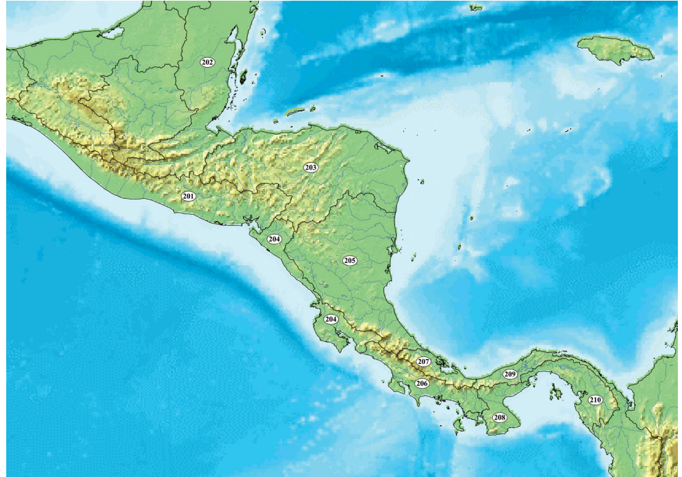
FIGURE 3 | Map of Central America with area delimitation based on Abell et al. , 2008 (Freshwater ecoregions of the world): 201 Chiapas–Fonseca; 202 Quintana Roo–Motagua; 203 Mosquitia; 204 Estero Real–Tempisque; 205 San Juan (Nicaragua and Costa Rica); 206 Chiriqui; 207 Isthmus Caribbean; 208 Santa Maria; 209 Chagres; 210 Rio Tuira; 211 Cuba–Cayman Islands; 212 Bahama Archipelago; 213 Jamaica; 214 Hispaniola; 215 Puerto Rico–Virgin Islands; 216 Windward and Leeward Islands; 217 Cocos Island (Costa Rica). Not all the regions indicated on the map have records of characiforms.