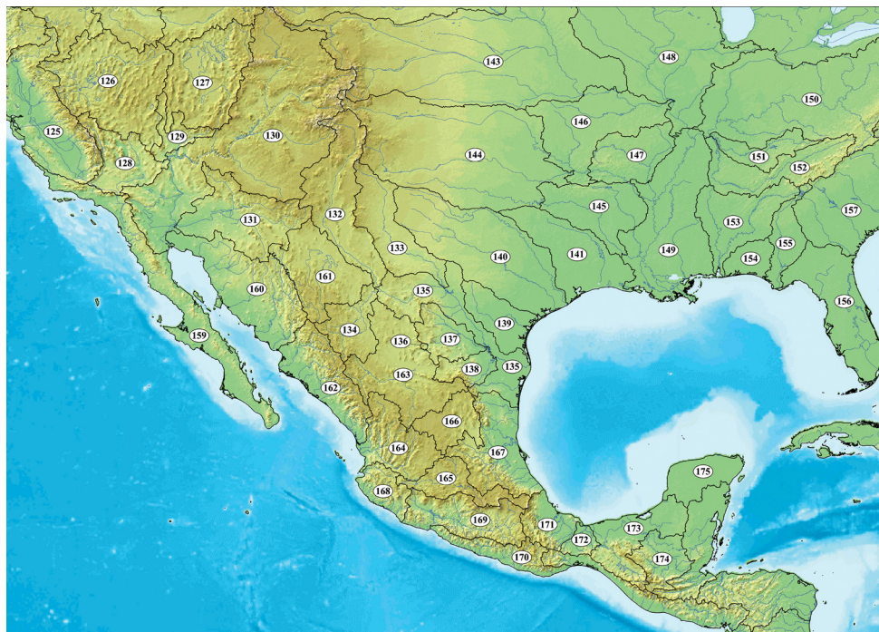
FIGURE 4 | Map of southern North America with area delimitation based on Abell et al. 's 2008 (Freshwater ecoregions of the world): 101 Alaskan Coastal; 102 Upper Yukon; 103 Alaska and Canada Pacific Coastal; 104 Upper Mackenzie; 105 Lower Mackenzie; 106 Central Arctic Coastal; 107 Upper Saskatchewan; 108 Middle Saskatchewan; 109 English–Winnipeg Lakes; 110 Southern Hudson Bay; 111 Western Hudson Bay; 112 Canadian Arctic Archipelago; 113 Eastern Hudson Bay–Ungava; 114 Gulf of St. Lawrence Coastal Drainages; 115 Canadian Atlantic Islands; 116 Laurentian Great Lakes; 117 St. Lawrence; 118 Northeast US and Southeast Canada Atlantic Drainages; 119 Scotia–Fundy; 120 Columbia Glaciated; 121 Columbia Unglaciated; 122 Upper Snake; 123 Oregon and Northern California Coastal; 124 Oregon Lakes; 125 Sacramento–San Joaquin; 126 Lahontan; 127 Bonneville; 128 Death Valley; 129 Vegas–Virgin; 130 Colorado; 131 Gila; 132 Upper Rio Grande–Bravo; 133 Pecos; 134 Rio Conchos; 135 Lower Rio Grande–Bravo; 136 Cuatro Ciénegas; 137 Rio Salado; 138 Rio San Juan (Mexico); 139 West Texas Gulf; 140 East Texas Gulf; 141 Sabine–Galveston; 142 Upper Missouri; 143 Middle Missouri; 144 US Southern Plains; 145 Ouachita Highlands; 146 Central Prairie; 147 Ozark Highlands; 148 Upper Mississippi; 149 Lower Mississippi; 150 Teays–Old Ohio; 151 Cumberland; 152 Tennessee; 153 Mobile Bay; 154 West Florida Gulf; 155 Apalachicola; 156 Florida Peninsula; 157 Appalachian Piedmont; 158 Chesapeake Bay; 159 Southern California Coastal–Baja California; 160 Sonora; 161 Guzman–Samalayuca; 162 Sinaloa; 163 Mayran–Viesca; 164 Rio Santiago; 165 Lerma–Chapala; 166 Llanos El Salado; 167 Panuco; 168 Ameca–Manantlan; 169 Rio Balsas; 170 Sierra Madre del Sur; 171 Papaloapan; 172 Coatzacoalcos; 173 Grijalva–Usumacinta; 174 Upper Usumacinta; 175 Yucatan; 176 Bermuda. Not all the regions indicated on the map have records of characiforms.