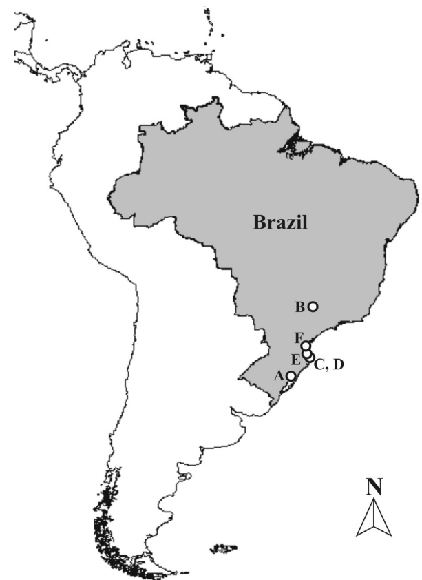
Figure 1. South America map indicating the sampled sites in Brazil of the Drosophilidae species associated to fruiting bodies of fungi in forested and anthropized environments (A, Campus of Universidade Federal do Rio Grande do Sul, Porto Alegre, RS; B, Campus of Universidade de São Paulo, Ribeirão Preto, SP; C, Campus of Universidade Federal de Santa Catarina, Florianópolis, SC; D, Morro da Lagoa da Conceição, Florianópolis, SC; E, Biguaçu, SC; F, Piraf, Joinville, SC).

A total of 910 individuals belonging to 31 Drosophilidae species were collected (Tabs. I, II). Among the drosophilid genera collected, Drosophila was the richest (17 species) and the most abundant in all environments sampled, even when compared to other exclusively mycophagous species, like Hirtodrosophila (five species), Leucophenga (two species) and Mycodrosophila (two species).