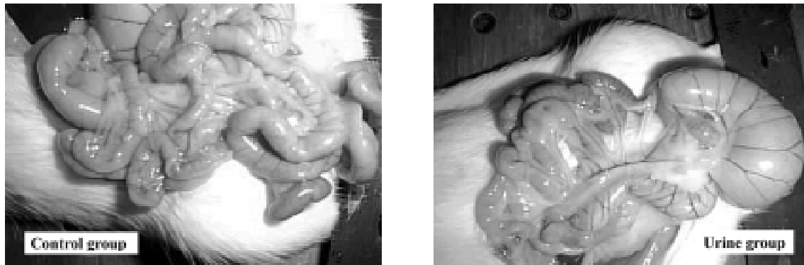
Figure 1 - Macroscopic aspect of the bowel loops after laparotomy

four (two mild and two moderate). Parietal necrosis or peeling were not observed in any animal. The score for group II had an amplitude of 0 to 5, with a median of 2.5. The total number of points for the group was 27. Figure 2 details the frequencies of each score for the two groups.