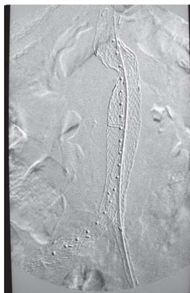
Fig. 4 - Right extension is covering the common iliac artery aneurysm and landing at the right external iliac artery at the end of the endovascular procedure