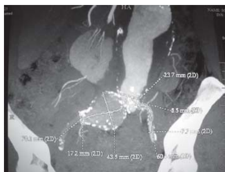
Fig. 3 - Occluded right common iliac artery aneurysm