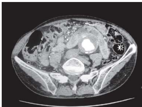
Fig. 1 - Computed tomography showing an abdominal aortic aneurysm (AAA) and horseshoe kidney