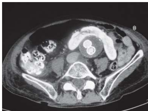
Fig. 6 - Postoperative Axial CT scan demonstrating the two limbs of the stent-graft and a well-fused horseshoe kidney and no leaks