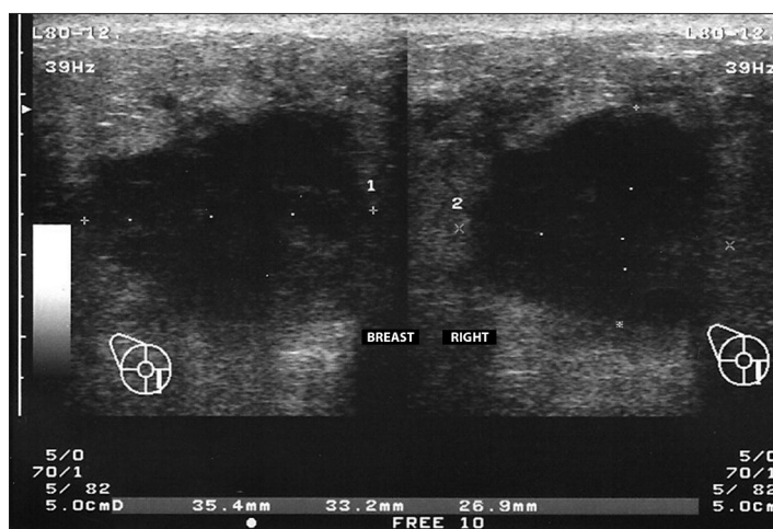
Figure 2. Breast ultrasound showing an irregular lesion with a central cavity containing liquid material.