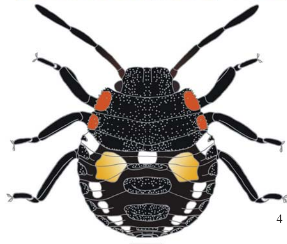
Figs 1-4 Chinavia longicorialis . 1, Adult (scale = 2 mm); 2, Eggs; 3, First instar; 4, Second instar (scale = 0.5 mm).