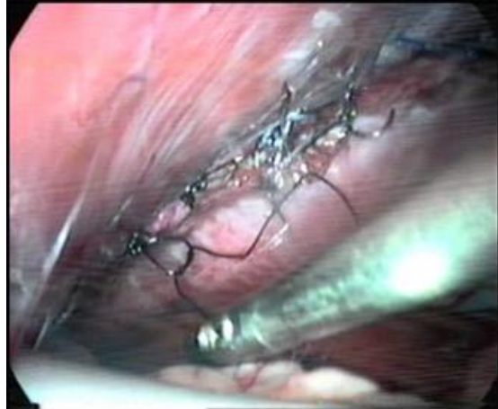
Figure 2. Left Paracostal hernia in an eight-month-old dog. Videolaparoscopic image shows intracorporeal suturing of the thoracoabdominal defect.