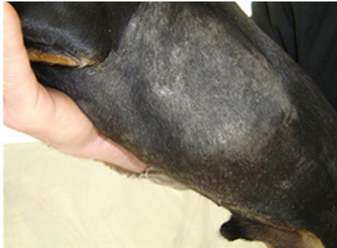
Figure 3. Eight-month-old dog, submitted to videolaparoscopy for treatment of a left paracostal hernia. Eight days after surgical procedure, small scars can be seen in the left abdominal wall where the trocars were inserted (arrows).

Given that the alterations present in the hernias are anatomical, the treatment is only accomplished by surgical reconstruction of the disrupted musculature (Smeak, 2007). The most common surgical approach for traumatic abdominal herniorrhaphy is middle line laparotomy or laparoscopy (Brun et al. ,